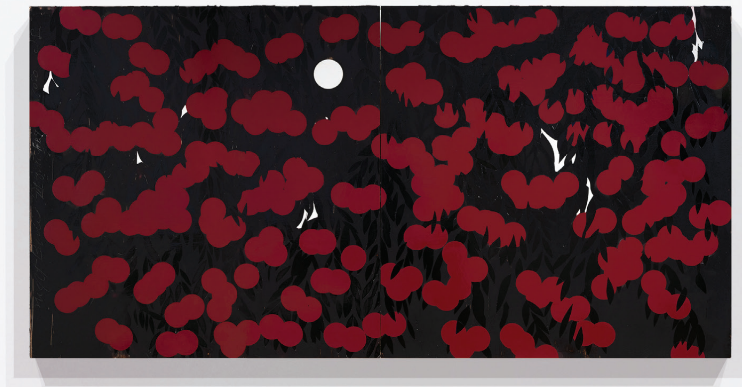
Night Berries Mimosa Feb 4 2020 Enamel and tar on masonite 122 x 244 cm