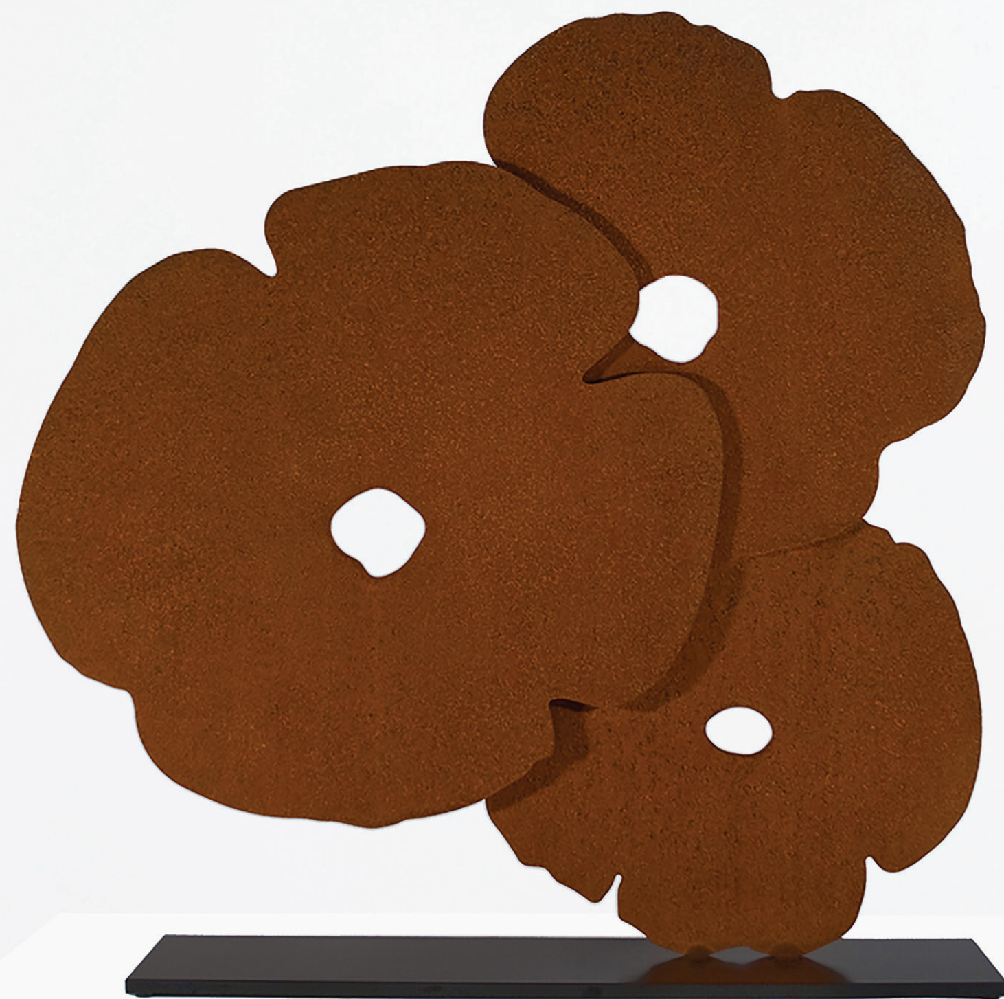
Corten Poppies, 2017 Shaped Corten steel on stainless steel base with black powder coat 92 x 24 x 18 cm