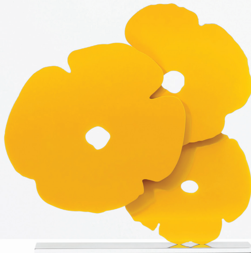
Yellow Poppies, 2017 Shaped aluminum with yellow powder coat on polished aluminum base 62 x 61 x 9 cm