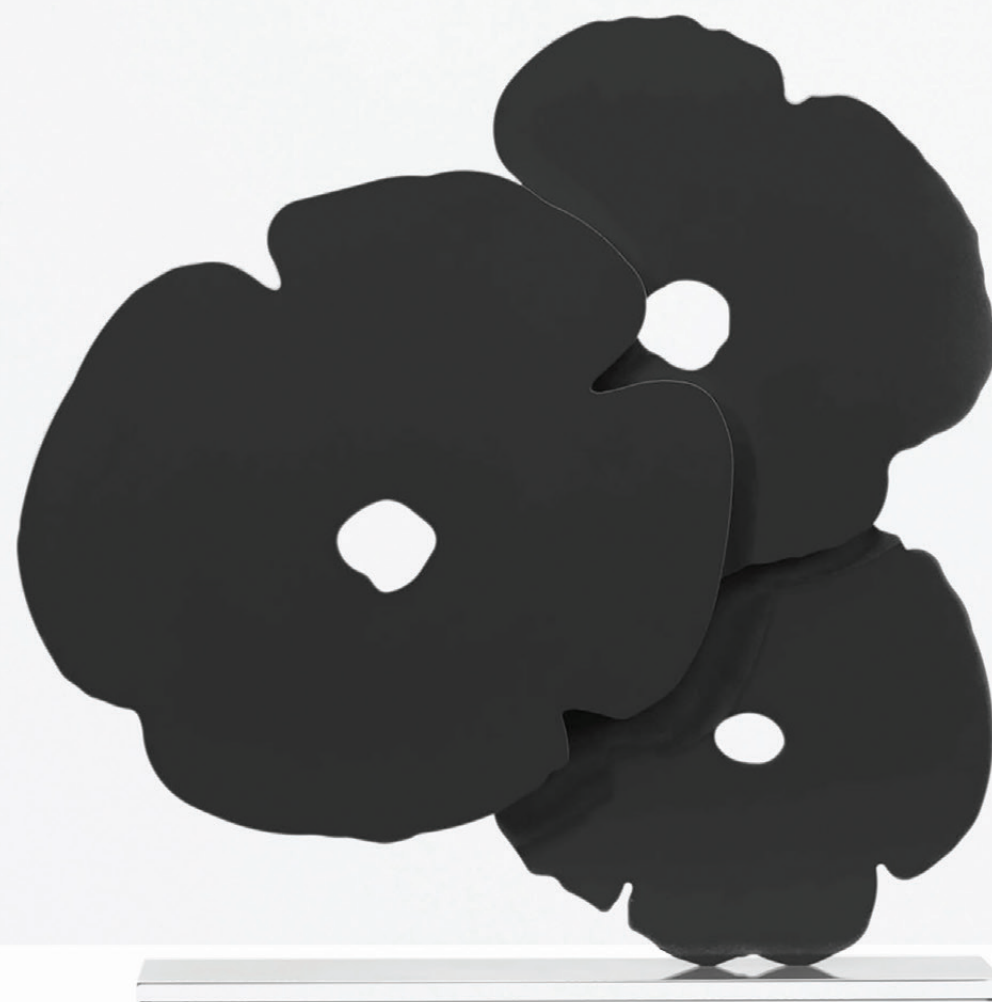
Black Poppies, 2017 Shaped aluminum with black powder coat on polished aluminum base 62 x 61 x 9 cm