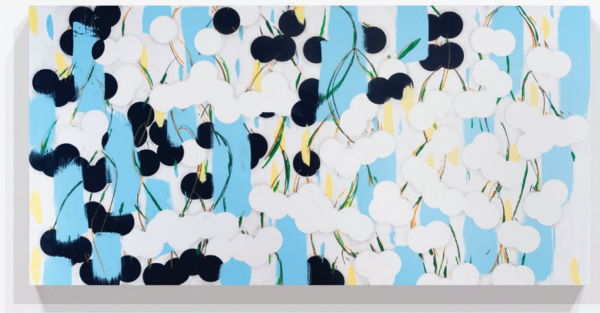
Winter Mimosa Jan 28 2020 Enamel, vinyl, oil pastel and graphite on masonite 91.5 x 183 cm