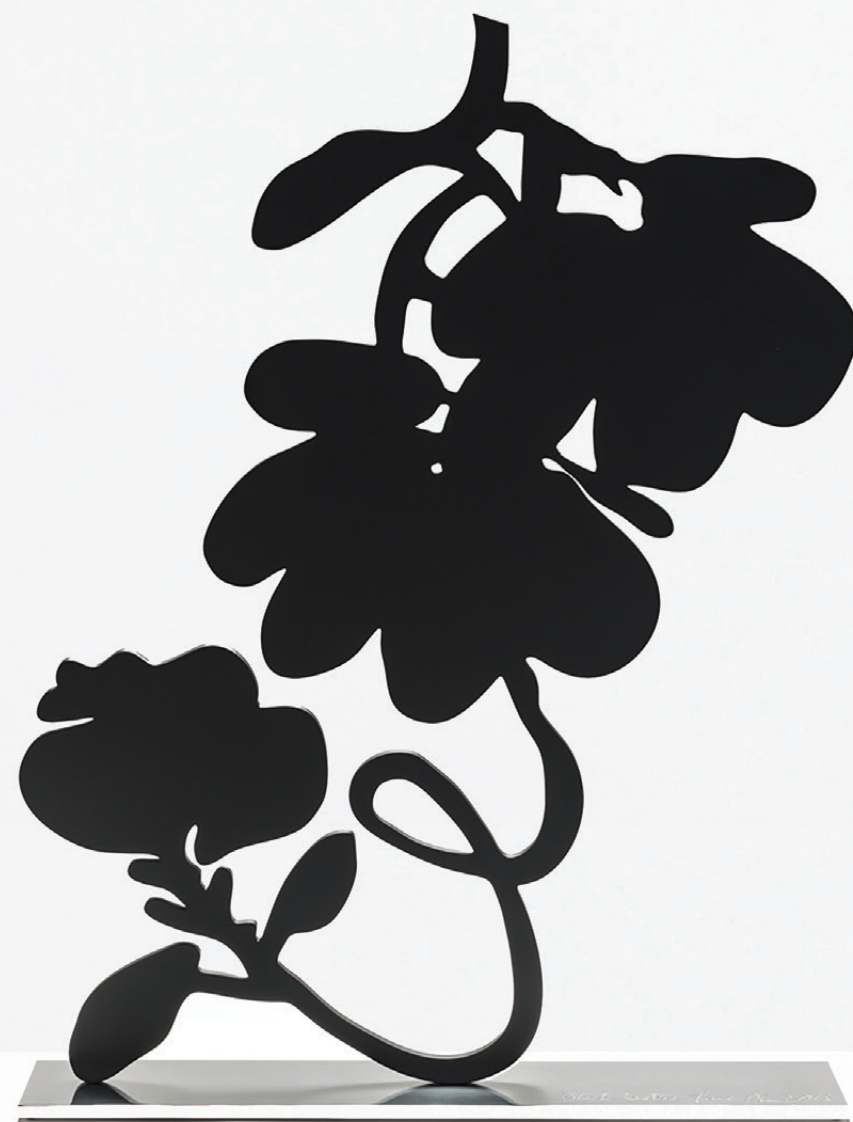
Black Lantern Flowers, 2018 Shaped aluminum with black powder coat on polished aluminum base 71 x 55 x 10 cm