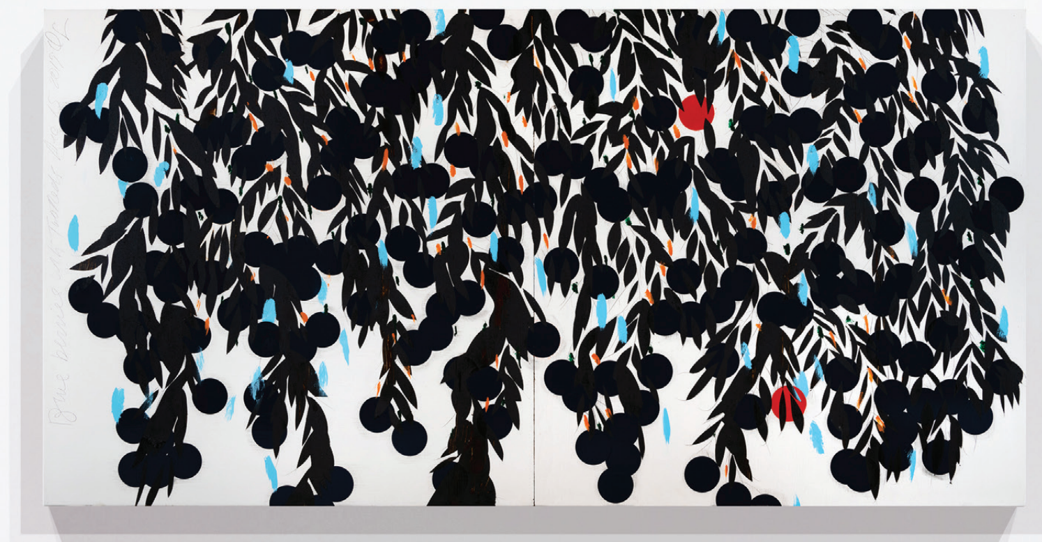
Blue Berries with Two Reds Dec 15 2019 Enamel, vinyl and tar on masonite 122 x 244 cm