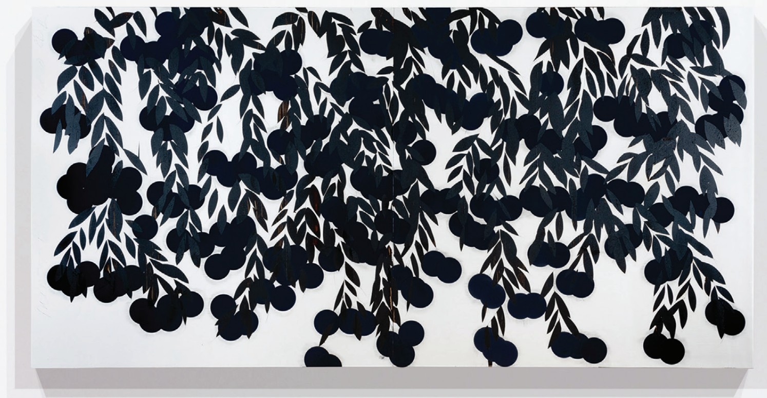
Mimosa with Blue and Black Jan 19 2020 Enamel, vinyl and tar on masonite 122 x 244 cm