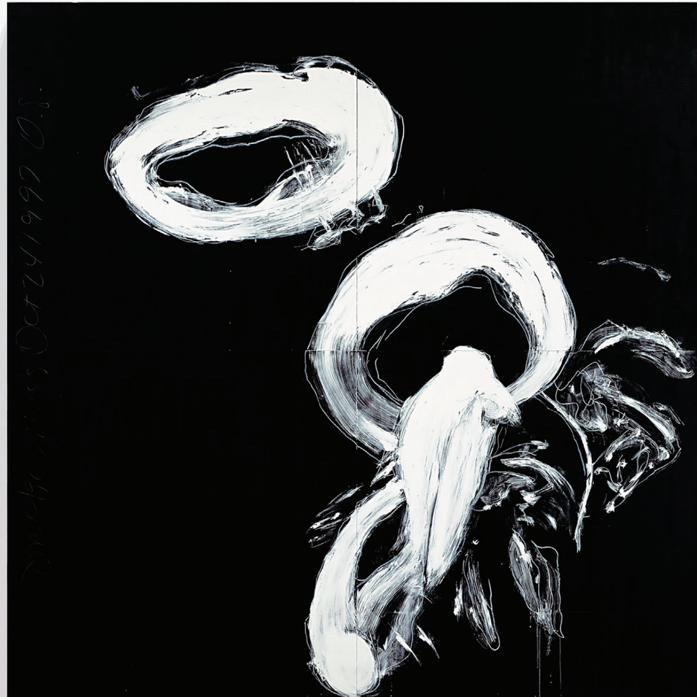
Smoke Rings October 24 1997 Spackle, oil on tile over masonite 244 x 244 cm