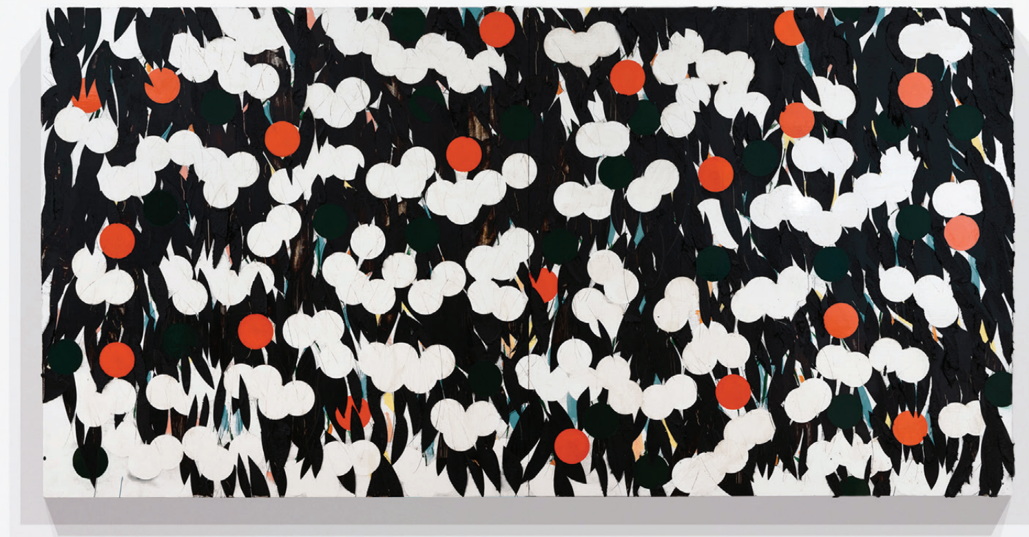
Autumn Mimosa Feb 18 2020 Enamel, latex, graphite and tar on masonite 122 x 244 cm