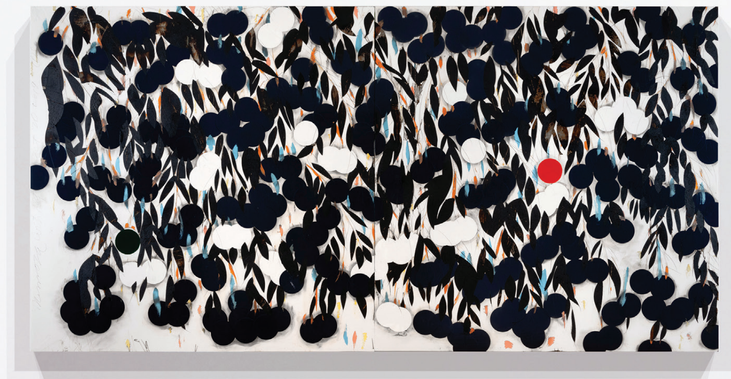
Mimosa with Red Oct 20 2019 Enamel, vinyl and tar on masonite 122 x 244 cm